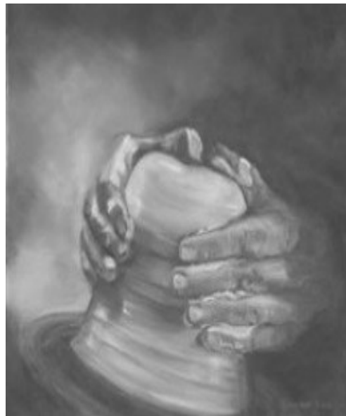
THE POTTER TOOK THE MARRED VESSEL IN HIS HANDS

Isaiah 57:15 gives us one of the most necessary ingredients that is often lacking on the part of humanity: "For thus saith the high and lofty one that inhabiteth eternity, whose name is Holy; I dwell in the high and holy place, with him also that is of a contrite and humble spirit, to revive the heart of the contrite ones." It is truly simple;