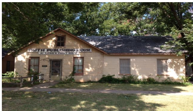
Print Shop built in 1928

for use. Again, in his words, “In this building the workers are busy printing, wrapping, and mailing thousands of papers and gospel tracts.”