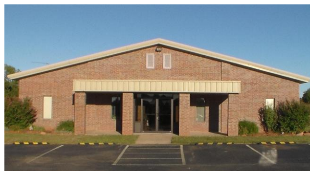
Faith Publishing House 1998

Time inevitably brings change. However, the one thing that is unchangeable is God's Word. This publication and the gospel outreach efforts of the FAITH PUBLISHING HOUSE will continue without compromise to fully embrace the principals and sound teaching of the Bible.