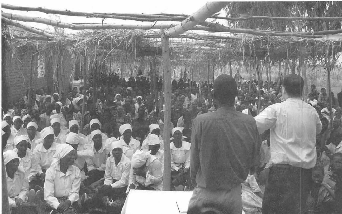
Sunday morning service in Malawi.

Faith Publishing House P.O. Box 518 Guthrie, OK 73044