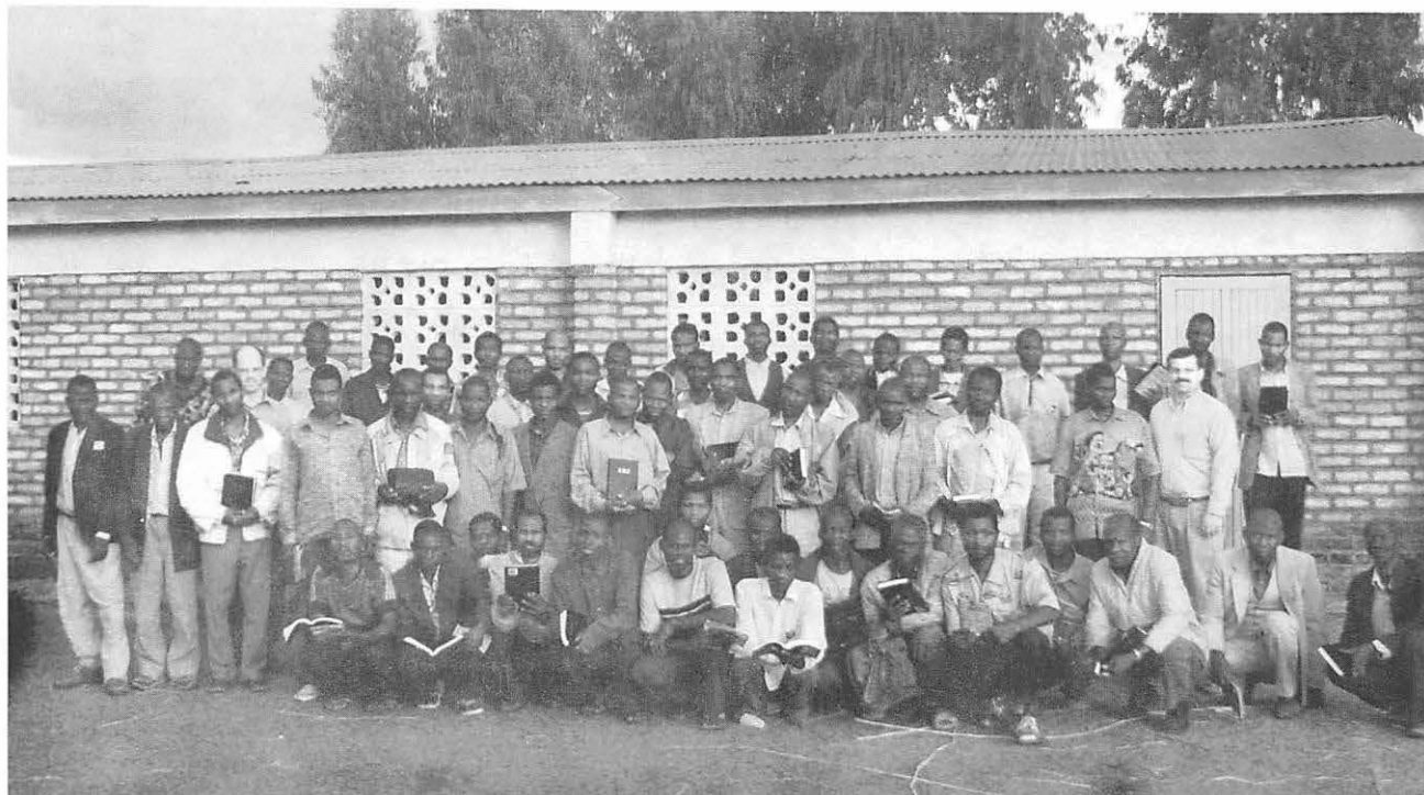
Ministers who attended the Ministers' Meeting in Malawi.