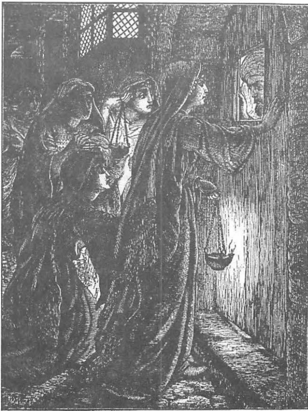
The Foolish Virgins

I was close to the front of the line. As we began loading, the driver stood at the door and asked for our ticket. I pulled my ticket out and handed it to him and he looked at it and told me that my ticket was for another bus line and I had to have their ticket to ride their bus. He told me to go get the right ticket. I had to go wait in line at the busy ticket counter to get my ticket changed. The man at the counter said, "You've been here all night, why didn't you get this taken care of a long time ago?" I told him, "I didn't know I was supposed to." Thankfully the Lord had mercy on me and I was able to still get on the bus before it left. Since I was one of the last getting on the bus I had to stand in the aisle for part of the trip until a seat became available. But at least I was on the right bus.