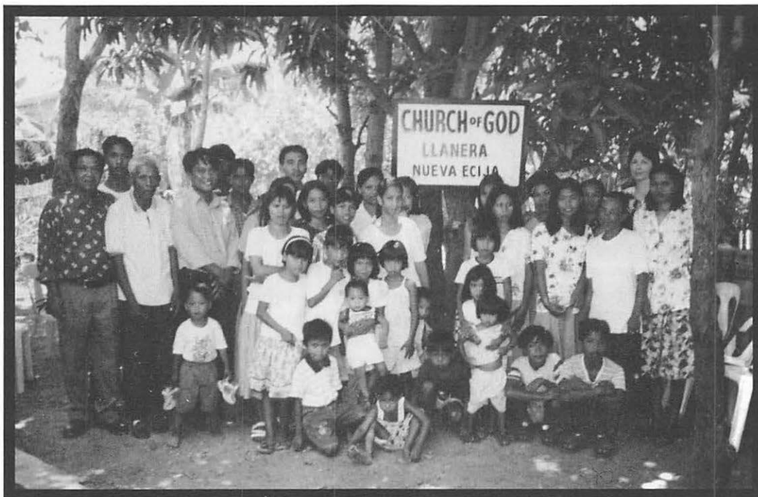
LLANERA CONGREGATION—A CHURCH BUT NO BUILDING