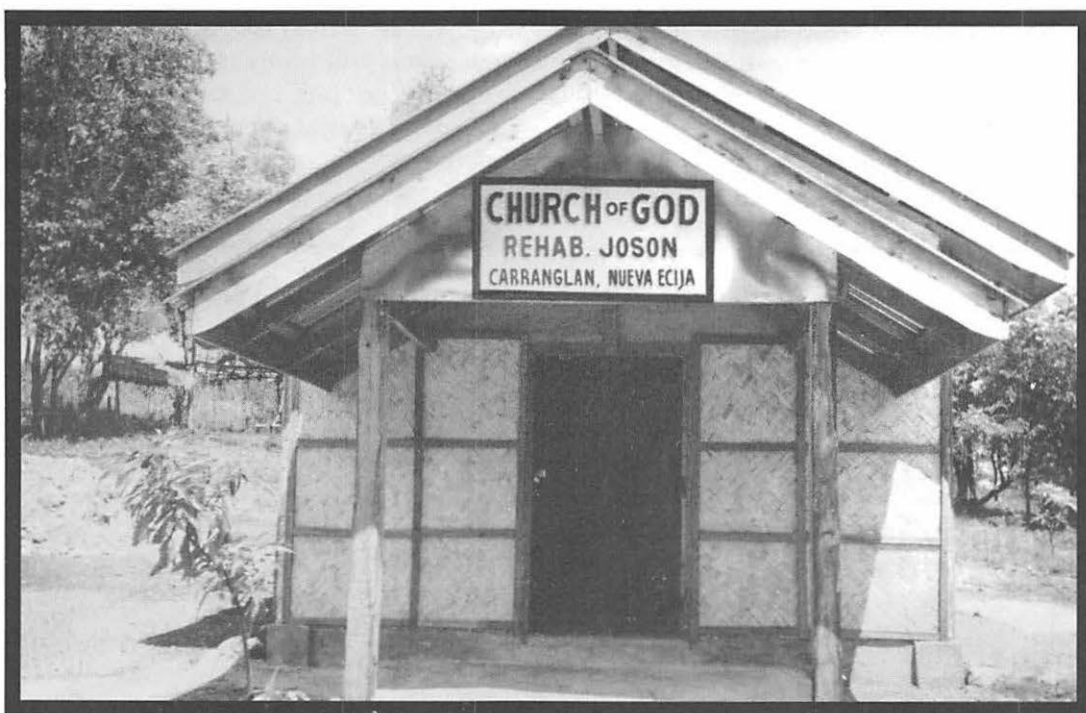
NEW CHAPEL BUILDING AT REHAB. JOSON