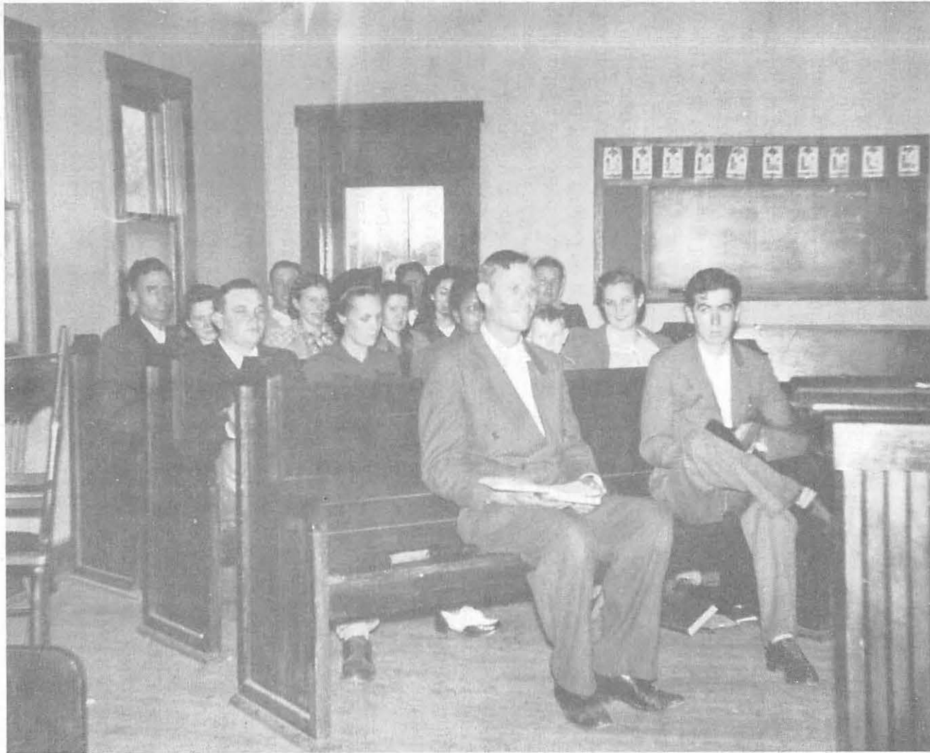
This photograph was taken of a group of saints who were in attendance at the 1948 Guthrie, OK Assembly Meeting.