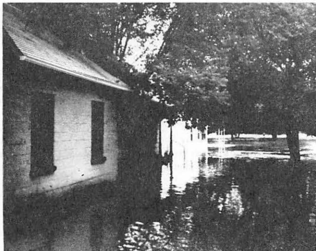
View of the floodwaters in front of the Print Shop.