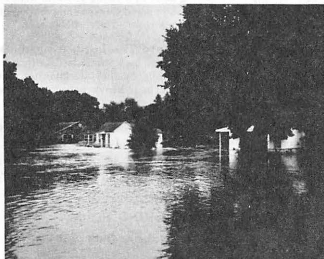
Looking across the street from the Print Shop.