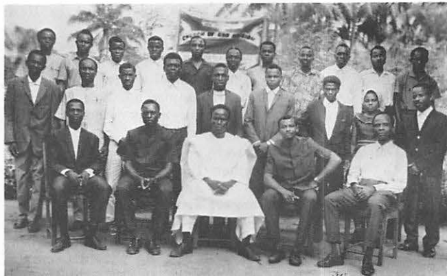
Gospel workers attending the 11th annual campmeeting last December in Nigeria, West Africa.