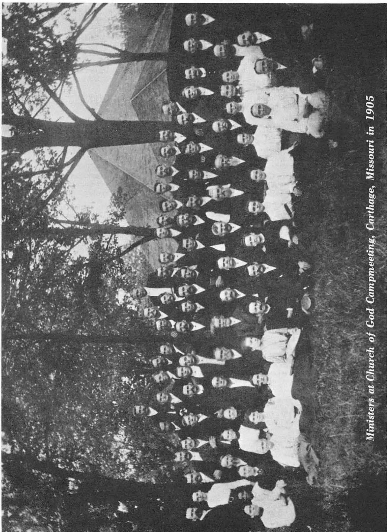
Ministers at Church of God Campmeeting, Carthage, Missouri in 1905

(See the list of names on the other side)