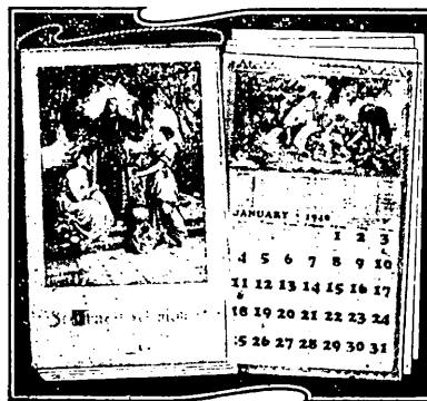
Above articles Post Paid to any address in U. S.

1948 Scripture Text Calendar depicting Bible scenes and characters, fixed to hang on the wall. Size 9½ by 15½ inches. It is, as usual, a beautiful calendar, price 35 cents each, three for $1.00, 12 for $3.50, twenty-five for $6.75.