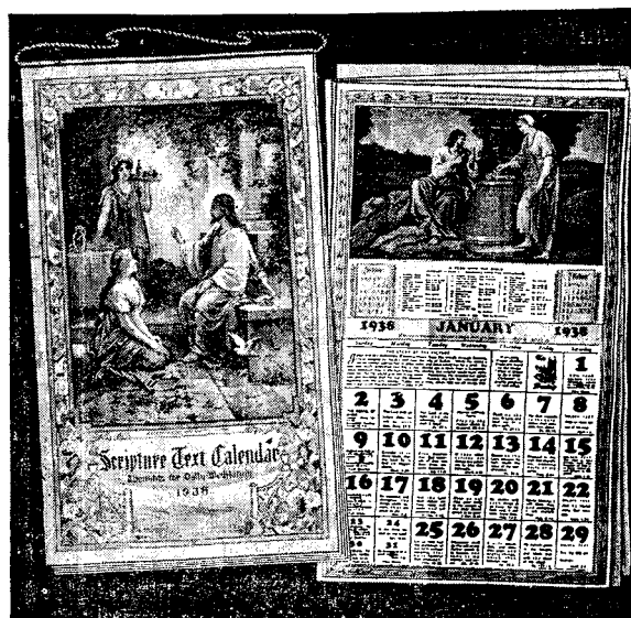
1938 SCRIPTURE TEXT CALENDARS

They are the finest of religious art. One picture is worth the price of the Calendar. There are 13 beautiful pictures used in this calendar. Send your order now. Price of each Calendar is 30 cents postpaid to you—Four calendars for one dollar—Nine calendars for two dollars. All postpaid to you.