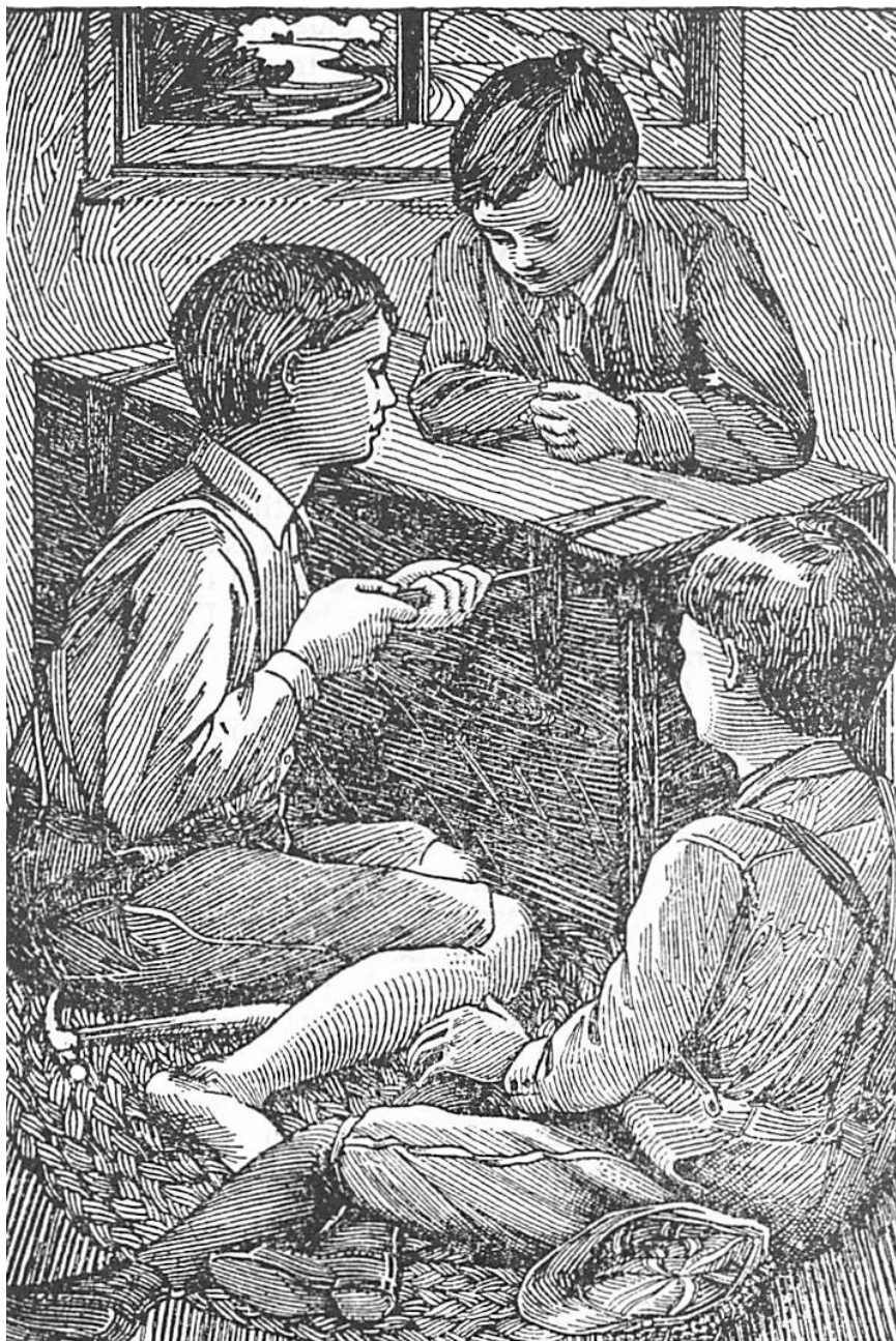
Opening the Chest