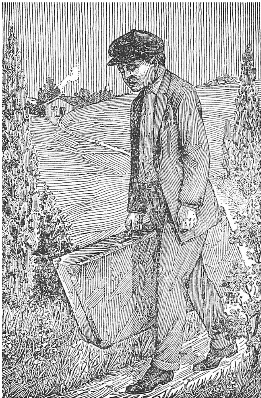
Leaving the Old Homestead