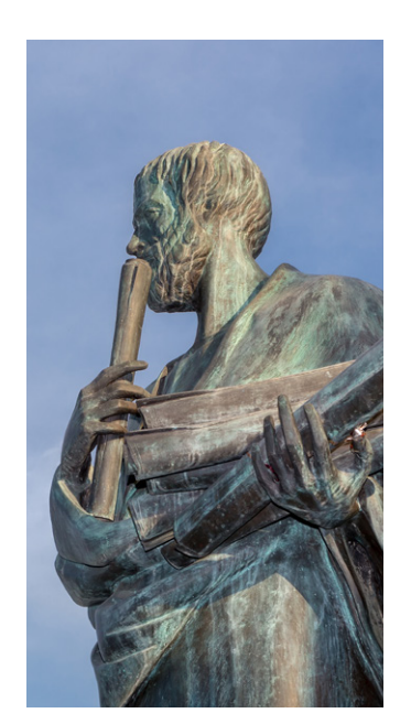
"The greatest power of the world is not even in the things but in its philosophies and ideologies."