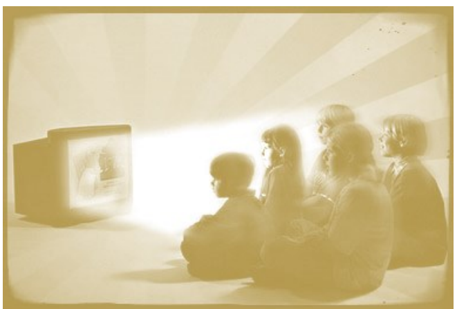
When one begins to feed on movies, it often increases the appetite and desire for more and more.

King David said it right and true in Psalms 101:3: "I will set no wicked thing before mine eyes: I hate the work of them that turn aside; it shall not cleave to me."