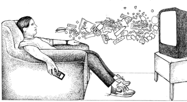
Why would a child of God who desires to live a holy life fill his heart and mind with things that are clearly ungodly?

Everyone, but especially children and young people, are