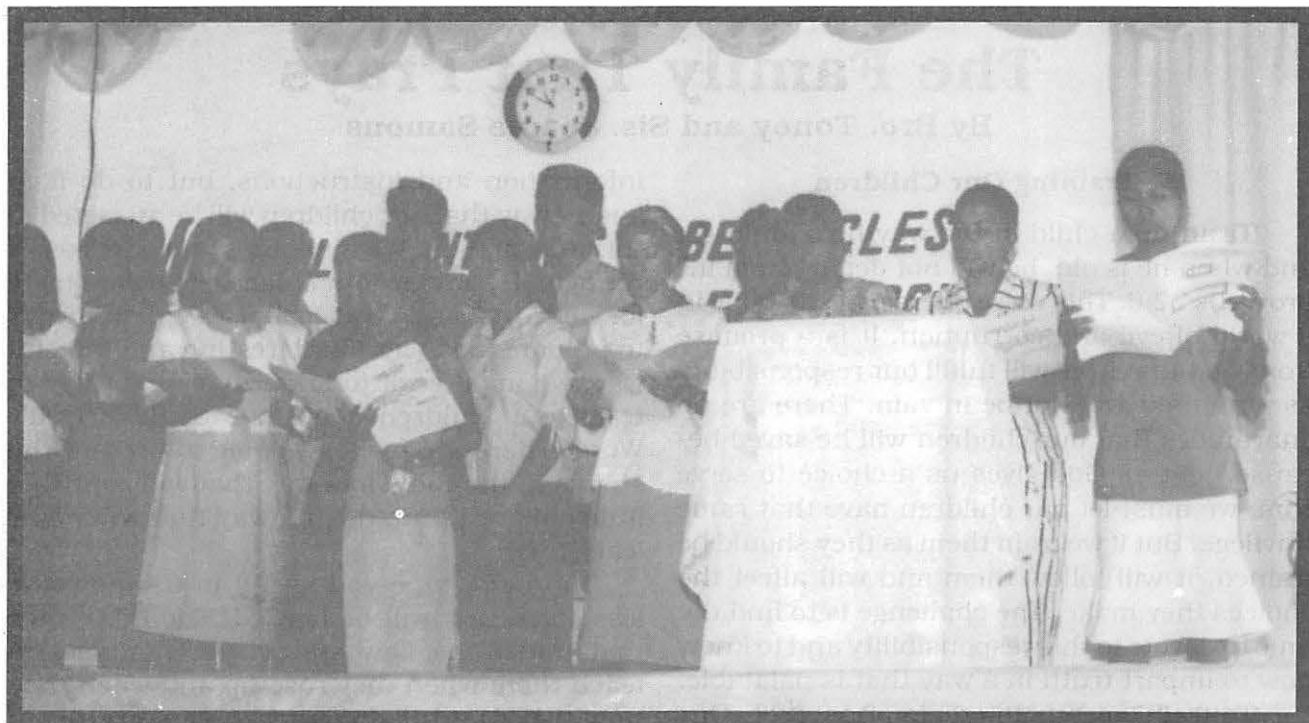
Saints in the Philippines sing unto the Lord.