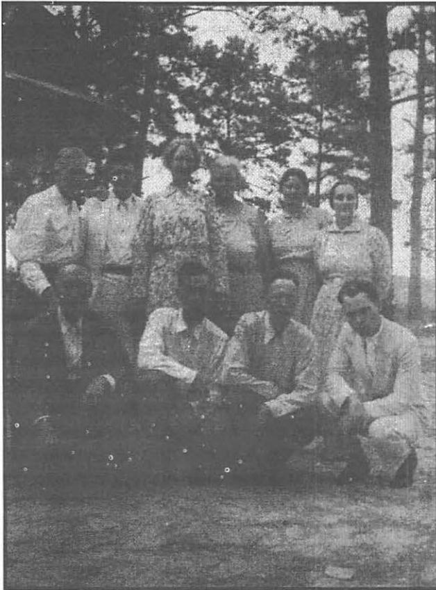
Ministers at the Hammond, LA, Camp Meeting Approximately 1945.