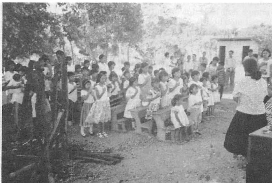
Vacation Bible School graduation ceremony in Pulang Lupa, Philippines