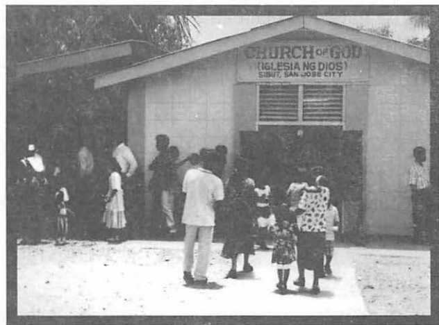
Church building at Sibut