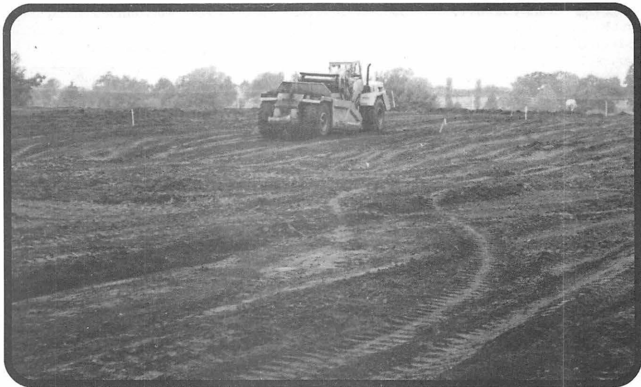
Dirt work in progress on the new Print Shop property.