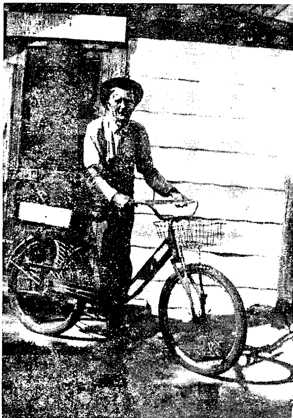
What The Lord Is To Me

I thank the Lord for this wonderful salvation that saves us from all sin. I gave my heart to the Lord and became a Christian when I was a young man. The Lord helped me to live a clean life. He has given me good health even up to this present time. I am past eighty years old now. I am very active for a man of my age. The Lord blesses me in preaching the gospel from the pulpit. The Lord helps me very much in showing my love to others in personal work. I distribute a hundred "Faith and Victory" papers each month; also a number of tracts. The Lord blesses me much as I work for Him.