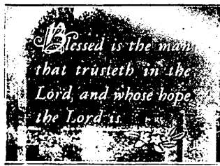
No. 614 Price $1.25