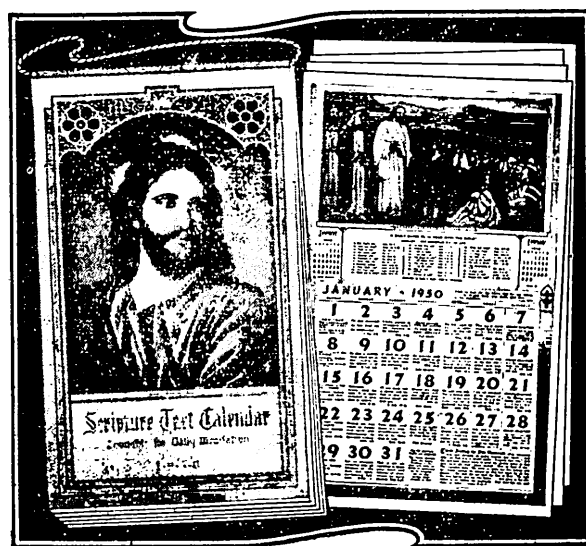
Scripture-text wall calendars with beautifully colored pictures. Postpaid to any address in the U. S. for 35 cents each, 3 for $1.00, 12 for 3.50, or 25 for $7.00.